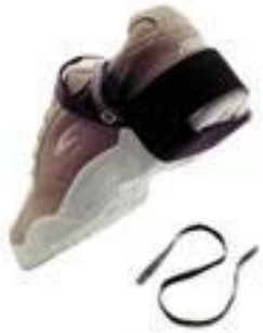
Stretch Velcro for comfort Quick on-off attachment and removal

Botron High Quality Snap-Off Tab grounders are made from the best products on the market. Our heel grounders have the largest cup design with better floor contact and better testing when soiled. With its dual layer construction non-marking interior and conductive outer surface is designed for long wear. The 18" conductive ribbon (snap-off tab) provides a safe static discharge to ground when tucked into your shoe. We sew our own products so we can make it any way you need. The B7535 has stretch Velcro fastening system for comfort with a built in 1-megohm resistor, we also offer 2meg and no resistor products. Disclaimer. All statements of technical information are believed to be true and are based upon tests we believe to be reliable. The proper use and application for this product must be the responsibility of the user. The statements herein shall have no force or effect.