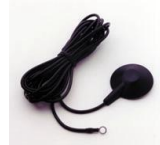
B9701 Floor mat grd